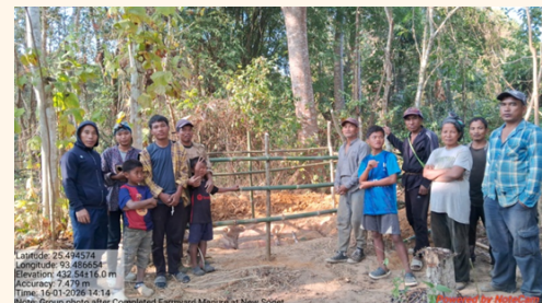
New Soget Village