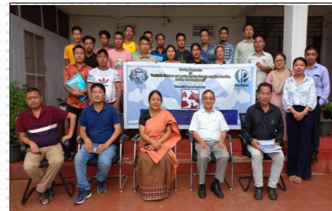
Pashu Sakhis Training

The last few years Pro Rural team observed the village communities importing meat sources like Chicken, pigs, and cattle, while they have the best environment and feed resources to manage their own production. The vast expansive grasslands and foliage for cattle with pure rural air and environment that is greatly suited to rear cattle, and plenty of tubers and corns for pigs and chickens, and yet the people still depend on imports for their meat requirements. Pro Rural intended to train and make the people aware on the potential of making use of the resources available that can be turned into lucrative businesses. Thus a livestock cooperative is to be formed and NABARD responded favourably. A series of training, including traing of 16 animal health care managers (Pashu Sakhis) were conducted for the people of the area with the help of the College of Veterinary Science and Animal Husbandry, Central university, Jalukie.