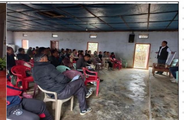
Development of Business Plans