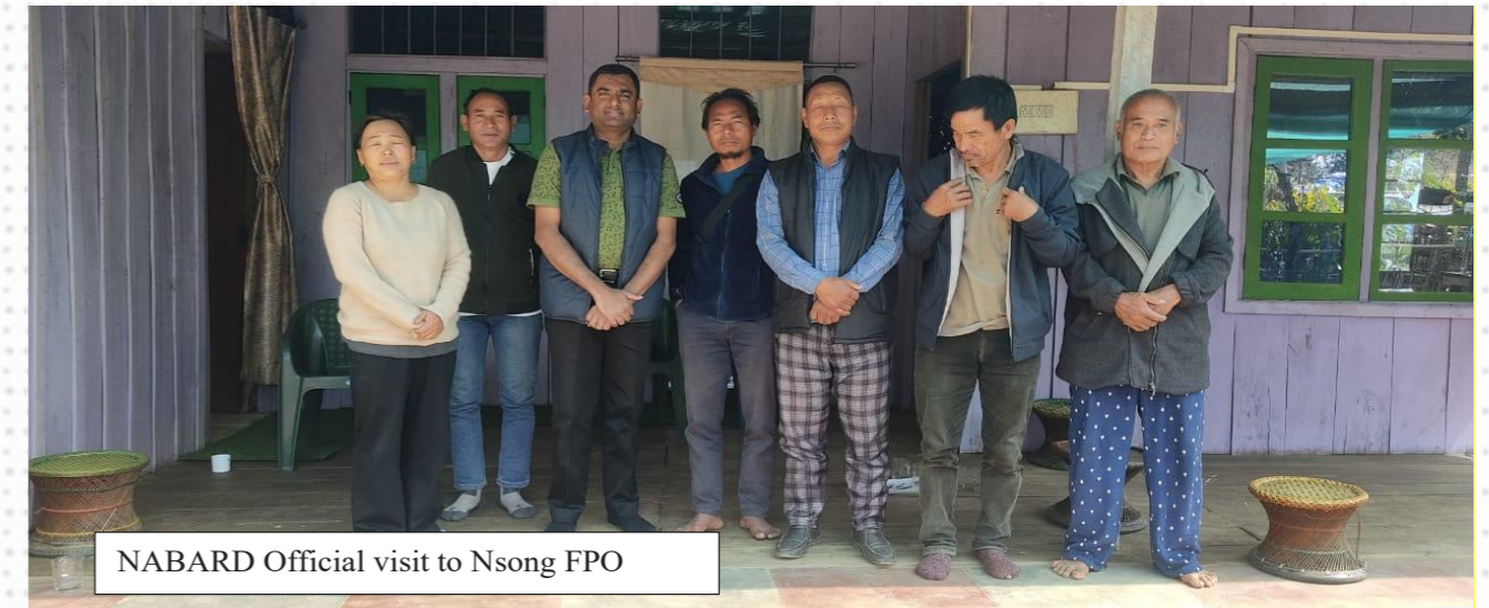
NABARD Official visit to Nsong FPO