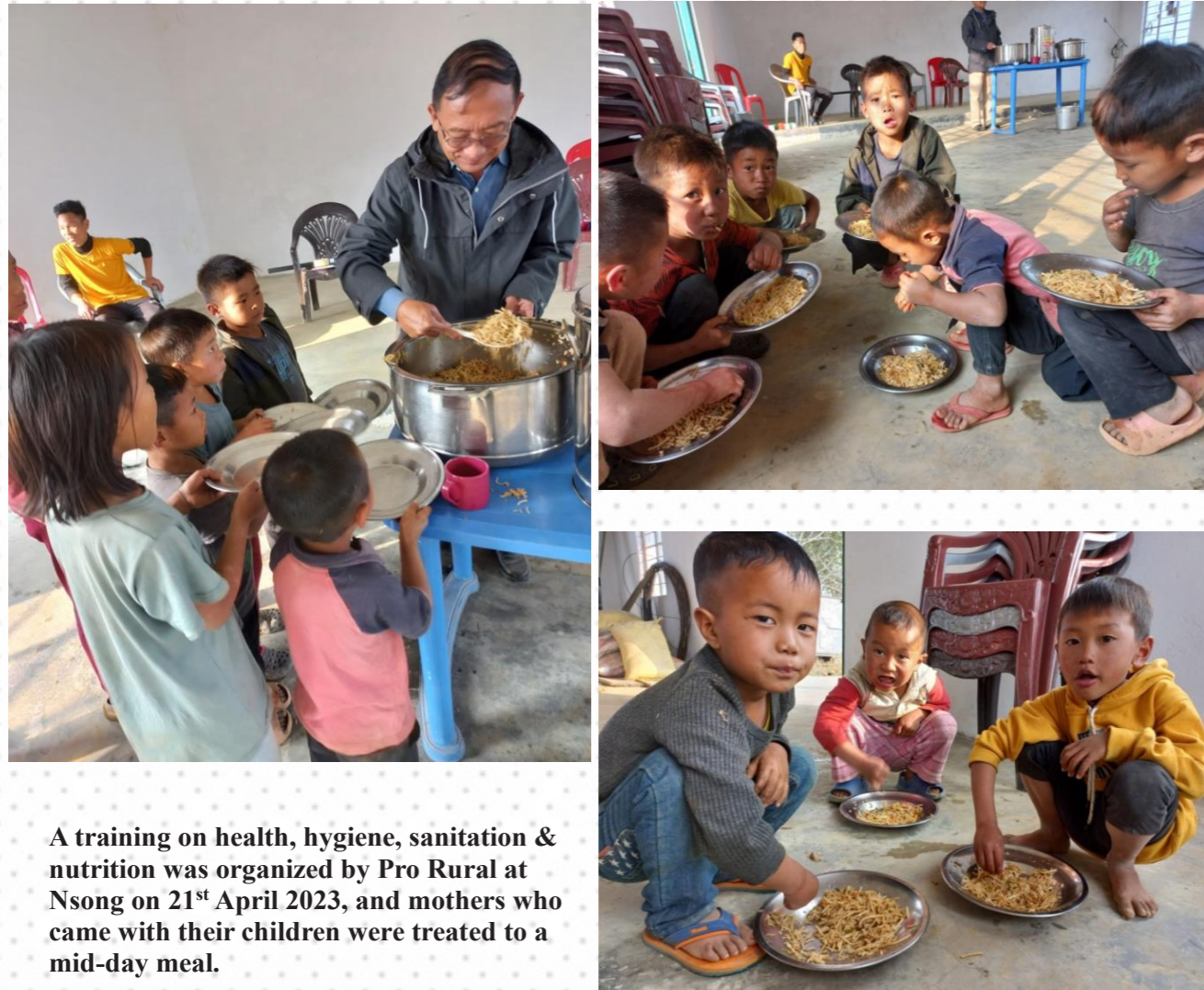
A training on health, hygiene, sanitation & nutrition was organized by Pro Rural at Nsong on 21 st April 2023, and mothers who came with their children were treated to a mid-day meal.

Often the children accompanied their mothers in the training programs and light refreshment are provided as mid-day meals.