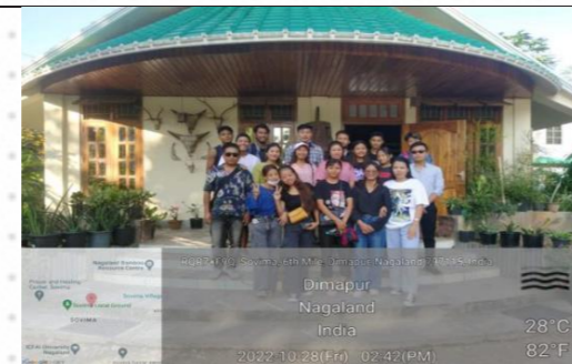
Trainees visiting tourist spots like the Museum for exposure