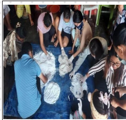
Soap & Detergent Powder