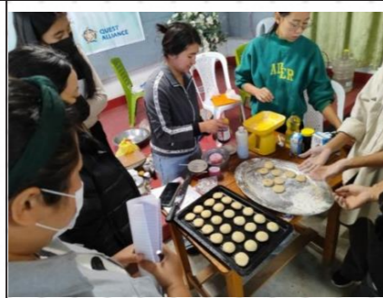
Baking & Confectionery