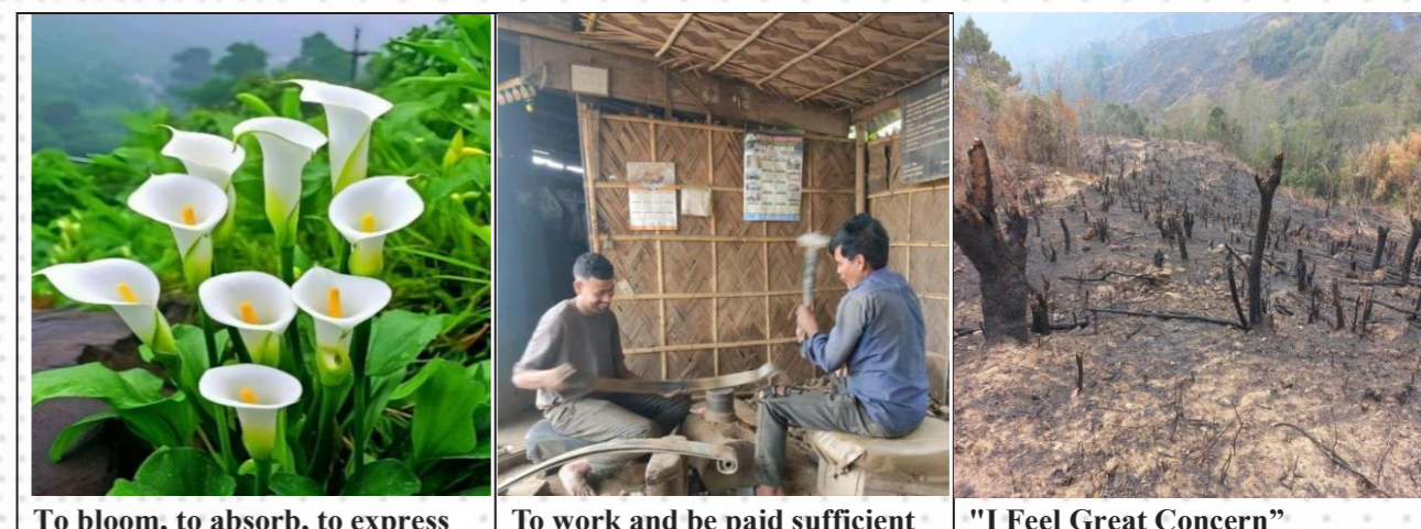
To bloom, to absorb, to express

The earth's Eco-system has become most fragile and vulnerable. The terrific pace at which degeneration of the environment is taking place is a matter of grave concern. Putting clearly before the youth for a debate and proposal of action plan has been the most effective means of preservation and conservation. A hundred youth resolving to mobilize a thousand friends for the cause of the life of plants and animals is the type of vision we have built up with youth.