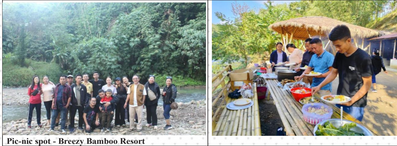
Pic-nic spot - Breezy Bamboo Resort

A day of fun, water sports and a short meeting marked the day's event.