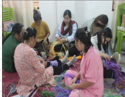
Basket Making Training