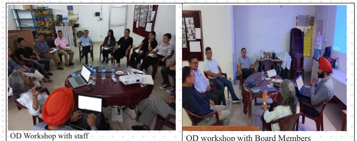
OD Workshop with staff

Quest Alliance has facilitated the Organization Development (OD) Process for some of their partners in the country and Pro Rural is fortunate to be one of them. An intensive re-visit of all aspects of the NGO with the objective of streamlining its governance structures, management systems including HR, Finance, and other policies, and development of program strategies. The OD process paves the way for robust positioning within the sector.