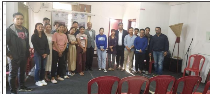
Tour Guide Training Participants with NEHHDC Team

The Tour Guide Training was supported by the North East Handicraft and Handloom Development Corporation - NEHHDC, Guwahati. The training was conducted for 30 graduate students at Chumoukedima with the Skill Ali as training partner. The duration of the training was 48 days with the examination conducted by Ministry of MSME, Government of India. Certificates were awarded to those who passed the examination. A tour guide kit was also to be provided to those who passed the exam, and possess a pass certificate.