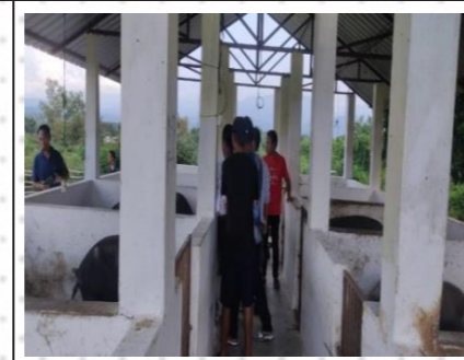
Pashu Sakhis Practical training