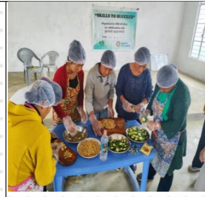
Food Processing training